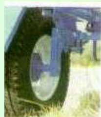
Drop Leg Axle