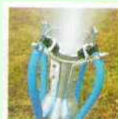
Multi jet outlet