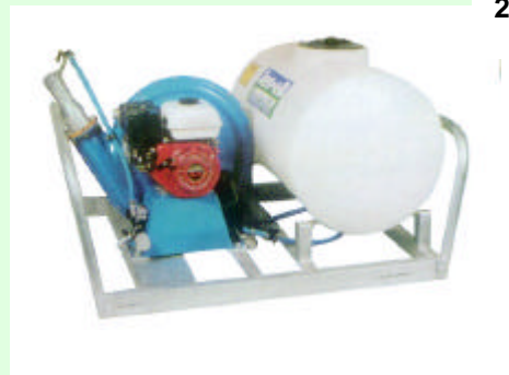
250 litre Mini Mister

*(sheep jetting, spot spraying or boom spraying can be achieved with optional accessories)