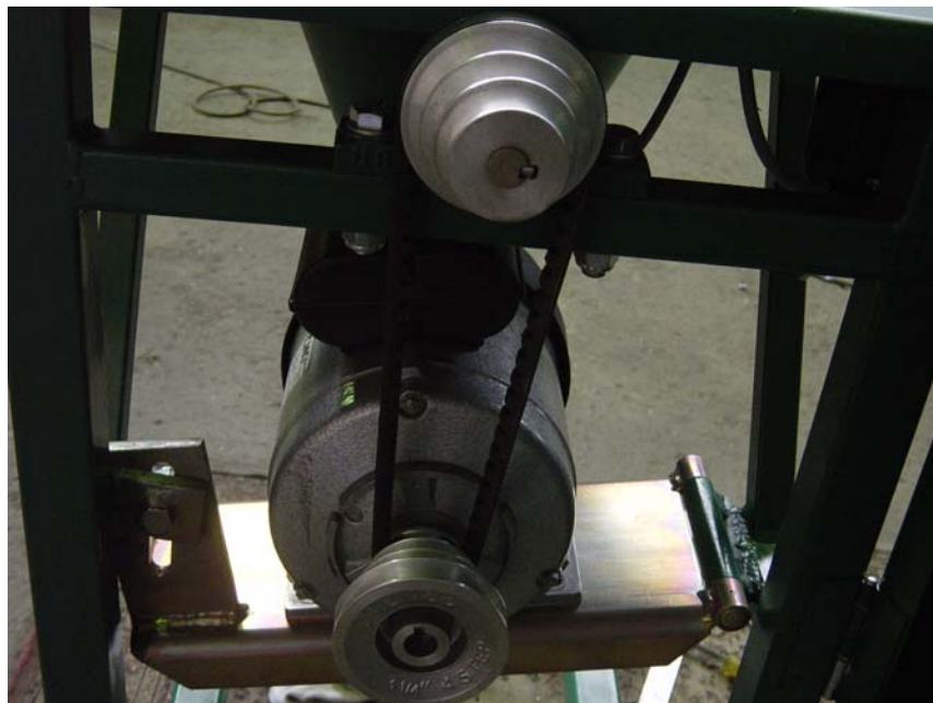
4 Step Pulleys allowing for different Speed Settings