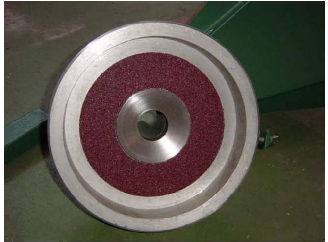
Standard Unit comes with Conventional Grinding Discs