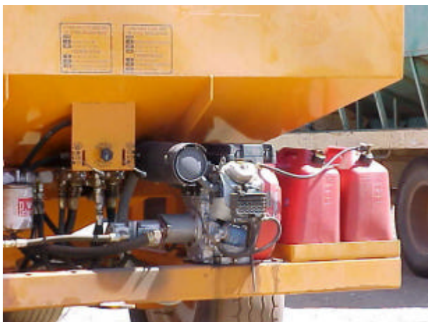
View of Petrol Engine