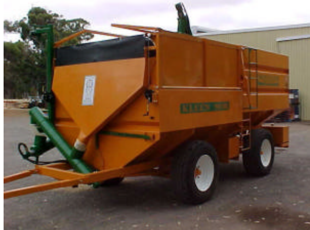
View From Right