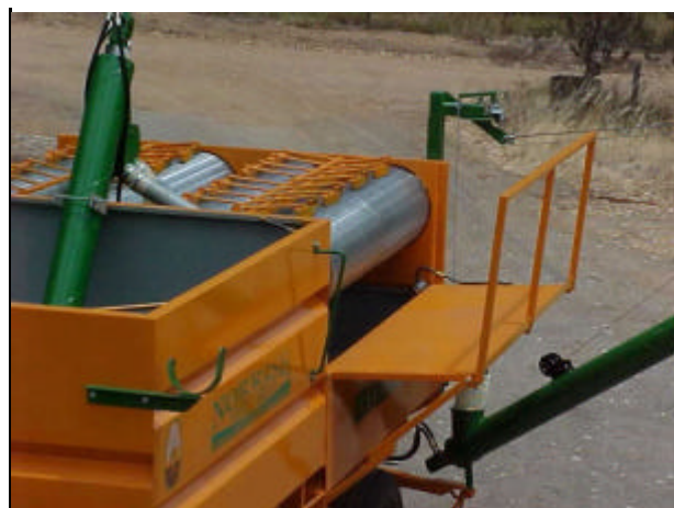
View of Cleaning Screens