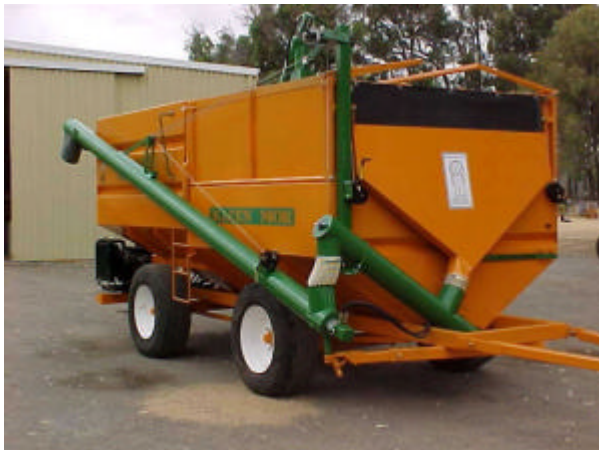
View From Left