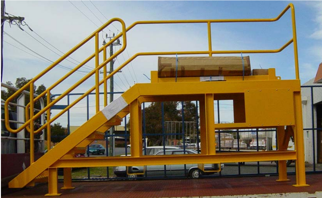
Safety Off Loading Platform

These are a few samples of the Safety related items we can produce. All items above have been built to meet the stringiest safety standards as demanded by both: