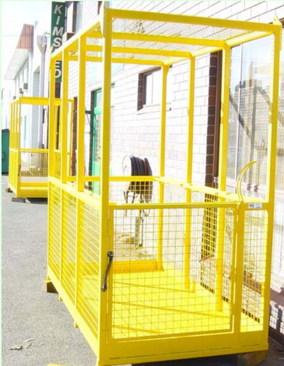
Building Site Safety Cages